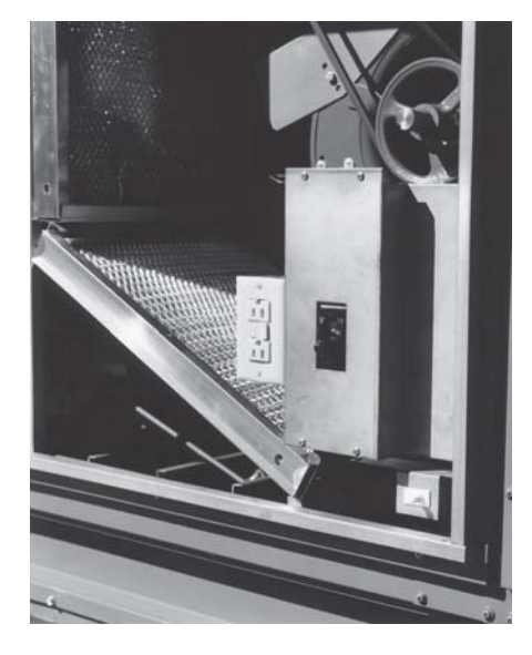
"N3" - Flush Mounted Disconnect Switch and GFI Convenience Outlet

Project: Location: Architect: Engineer: Contractor: PO Number: Date: