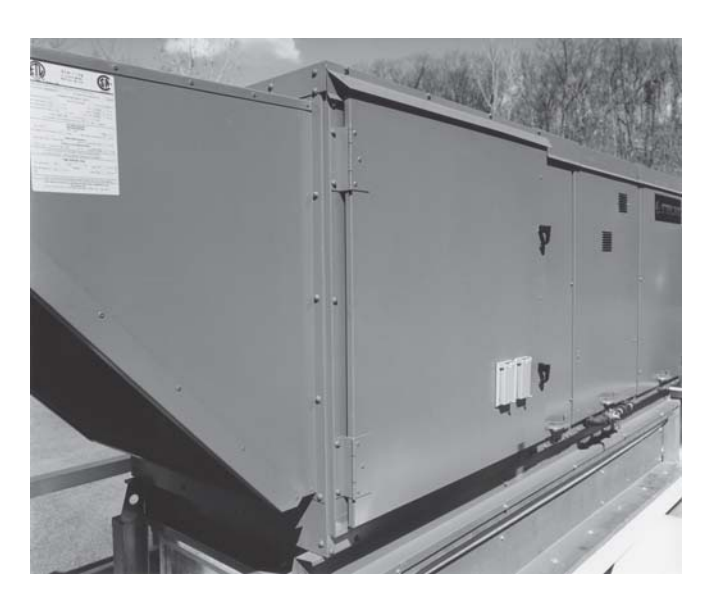
"N1" - Hinged Access Door(s)

Service Convenience Package includes a factory mounted, switch type fused disconnect and GFI convenience outlet located in the unit's blower cabinet. Both items are accessible from the outside of the unit via a weather resistant hinged access door. Also includes options number "N1" Hinged Access Door(s) and "N2" Through The Base Utility Penetrations.